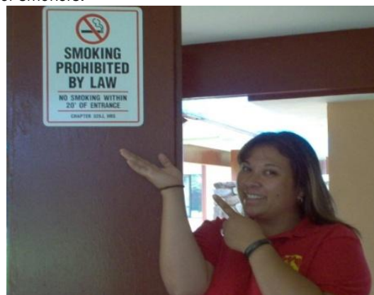
Hui No Ke Ola Pono posts reminders like this in their office to ensure a smoke-free place for their Healthy Cafe patrons, clients and workers.

Quitting takes a lot of work and self-determination. I think this process has added to my character, personally and professionally.