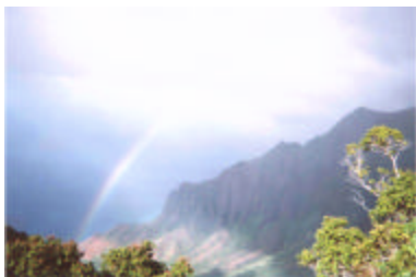
View from Kokee, Kauai January 10, 2006

In January 2006, a two-day Basic Skills training in tobacco brief intervention was held on Kauai for the Native Hawaiian Health Care Systems.