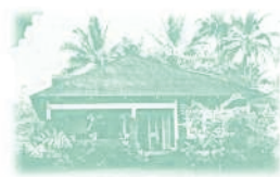
Halehuki circa 1940