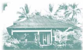
Halehuki circa 1940