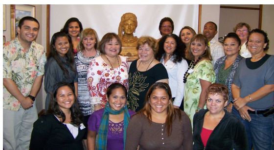
Graduates of Jan/Feb 2011 Training